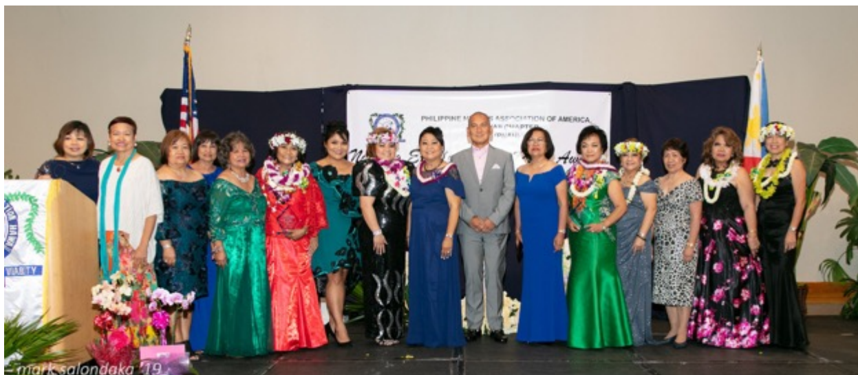
PNAH Executive Board Members